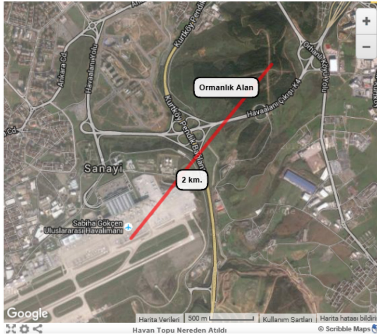
The mortar fire-positions in the Sabiha Gokcen Airport Terrorist Attack: http://www.hurriyet.com.tr/aa-sabiha-gokcen-havalimanindaki-patlamanin-nedeni-havan-mermisi-40037256 , Accessed on: May 23, 2016.

Notably, had the terrorists infiltrated to the mortar fire-positions with a third-generation MANPADS instead, then results might have been catastrophic. The minimum engagement range for an SA-18 is 0.5km for approaching and 0.8km for receding targets respectively. 20 Aircrafts are most fragile during landing and take-off due to low altitude/speed, thereby, they constitute 'lucrative and sensational' targets for terrorist use of MANPADS.